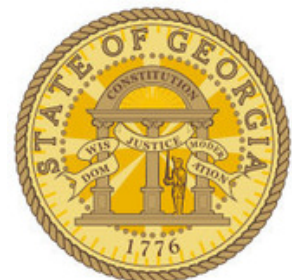
Lt. Governor Burt Jones

A handwritten signature in black ink, appearing to read "B. Jones".