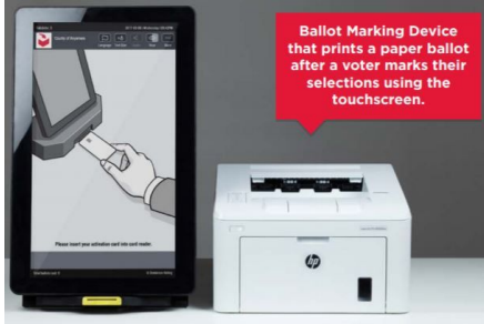
Ballot Marking Device that prints a paper ballot after a voter marks their selections using the touchscreen.